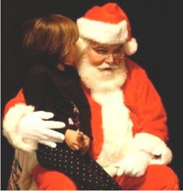
A very patient Santa listened to the requests of all the children who attended the PLAIN breakfast with Santa.