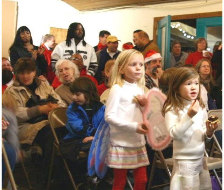
A standing-room-only crowd awaits the show at the Beach House and enjoys the cookies set out for the Cookie Exchange.